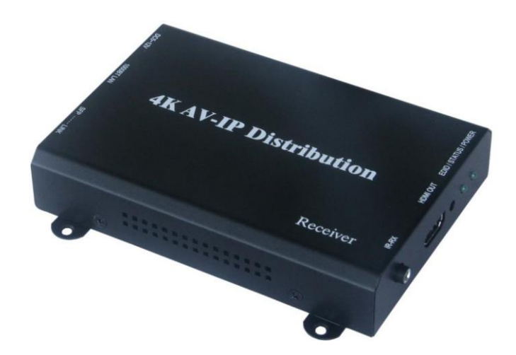
- Receiver HD2000-R: